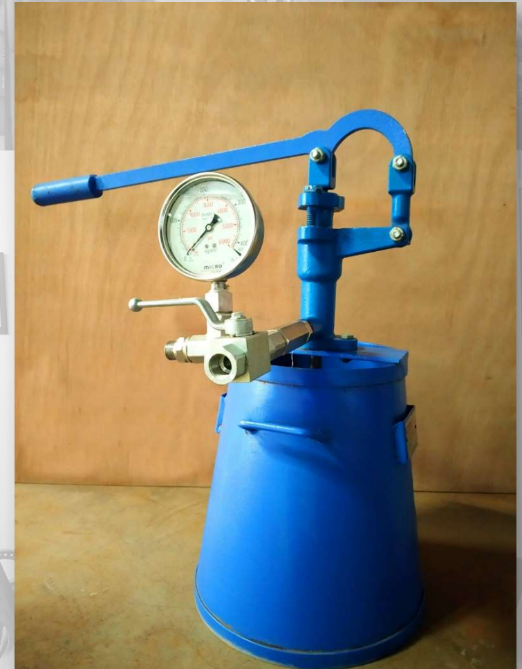
PRESSURE TESTING DEVICE (upto 400 kg/cm 2 )