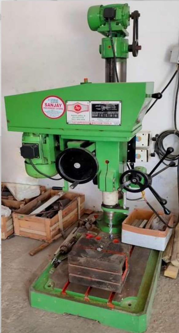
❖ VERTICAL DRILL