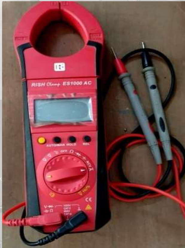
MULTIMETER CUM TONG TESTER