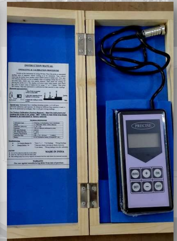
DFT MEASURING INSTRUMENT