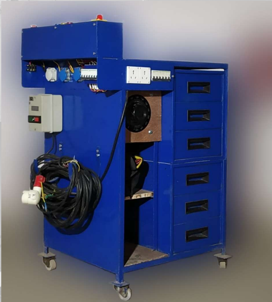
MULTI-PURPOSE ELECTRICAL TESTING TROLLEY