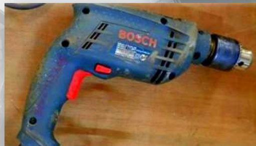
❖ HAND HELD DRILLS