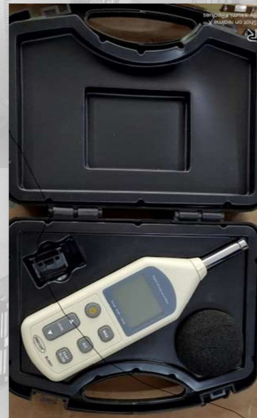
dB MEASURING INSTRUMENT