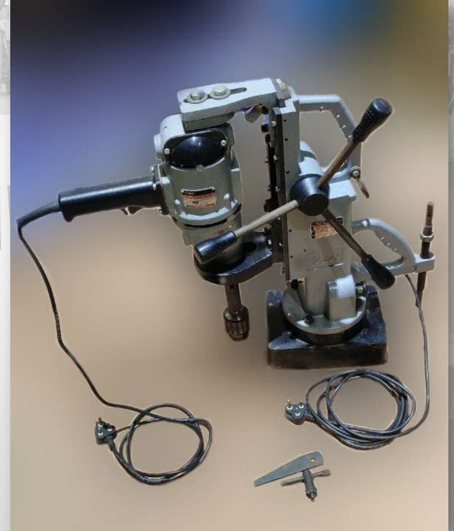
❖ MAGNETIC DRILL